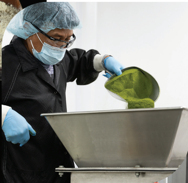
Left: Operator empties a scoop of hand-weighed powder into the mixer intake which remains stationary as the vessel turns.

Despite its modest volumetric capacity, the mixer outputs high volumes because it loads and discharges quickly and blend times are short, as little as 3 to 6 min.